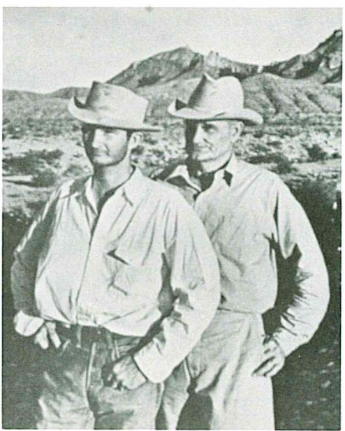
FATHER AND SON IN WEST TEXAS

For further information contact the Credit Union office, ext. 266.